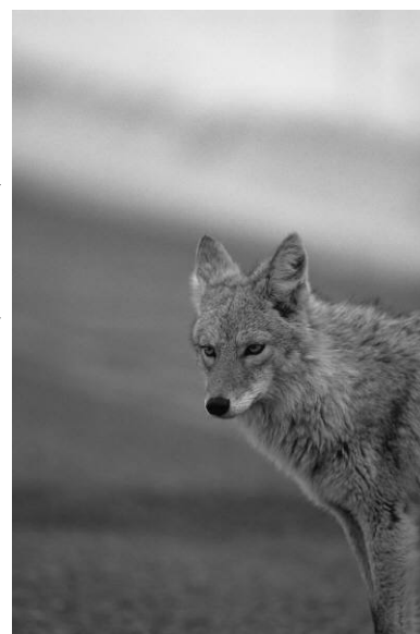
canis latrans (coyote)

some evidence to suggest that the subject coyote was one that had been injured, rehabilitated, and returned to the wild, and was probably accustomed to being fed by humans. Coyotes are very territorial and will not overpopulate a given area unless fed regularly by humans. They will move around at night as far as ten miles. Researchers have found that humans and coyotes can coexist peacefully, as the coyote fills the niche as the top predator in our area left vacant by the wolf many years ago.